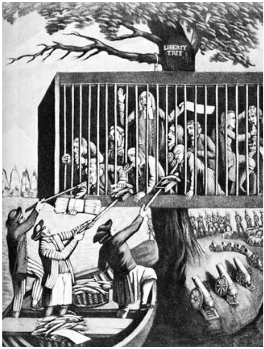
Colonists are shown providing aid to patriots in Boston in defiance of the "Intolerable Acts" imposed by Britain.

Delegates to the First Continental Congress (which included every colony except Georgia) affirmed their loyalty to King George III while rejecting he authority of Parliament. They also