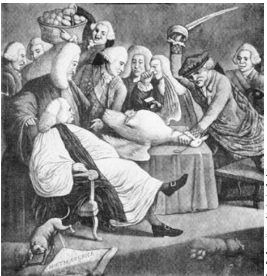
From The Cartoon History of the American Revoluti

The Sugar Act and the Stamp Act raised revenue which was earmarked specifically to offset the cost of stationing British troops in North America. The announcement of the new