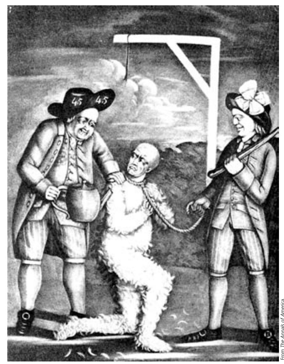
Colonists tar and feather a customs house official for accepting a shipment of tea.

Direct sales would allow the East India Company to reduce its costs. Even after paying the small tax on imported tea, the company would be able to beat the prices of smuggled Dutch tea. (At the time, at least 75 percent of the tea consumed in the colonies and 60 percent of the tea in Britain was smuggled in from Dutch colonies.) British officials assumed that the new regulations