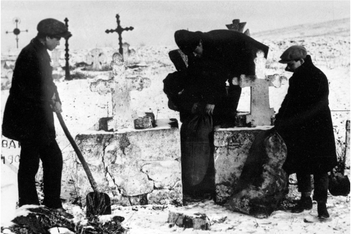
Soviet agents seizing grain hidden by a Ukrainian peasant in a graveyard.

Forced collectivization 2 in Ukraine coincided with famine there in 1932–1933 resulting in the deaths of around four million Ukrainians. Historians refer to this as the Holodomor , widely regarded as one of the great moral disasters of the period. But Stalin and party elites still relentlessly pursued a command economy. They would stop at nothing to achieve a “revolution from above” in which power emanated throughout society from a centralized state. And that state was to be administered by the Communist Party and its leader.