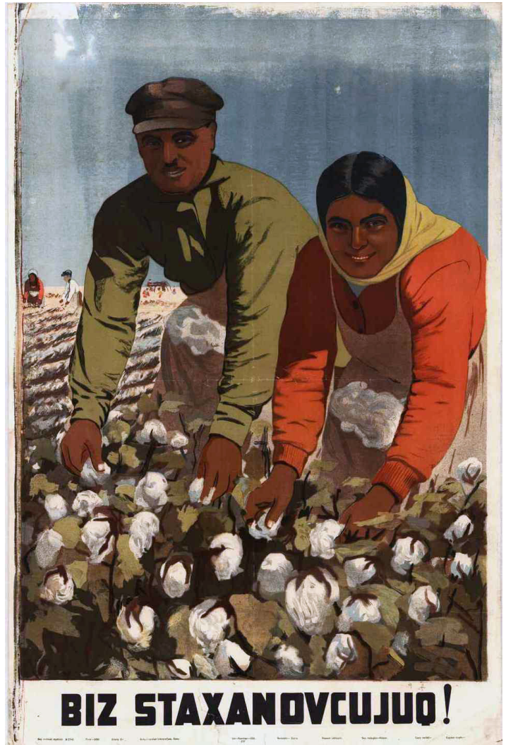
Poster of Azerbaijan, 1936—Labor Ethics. The words at the bottom of this idealized Image of Labor Equality translate to “We do it like Stakhanov.” Alexey Stakhanov was a “Hero of Socialist Labor” and his pro-socialist work ethic was publicized in this campaign to increase worker productivity. Public domain.

Under Stalin, the USSR embarked on a path toward a centralized command economy. It met many obstacles in its path as circumstances changed in the late 1920s and 1930s. The need to modernize the economy, food shortages, famine, the specter of war with Germany all drove Stalin and Soviet leadership toward more radical policies. Like many things born of necessity, the state that emerged out of this was imperfect. Stalin may have aspired to a finely tuned totalitarian regime, but reality on the ground was less harmonious. While the state he oversaw shaped Soviet life in important ways, it stopped short of becoming fully totalitarian. We can perhaps think of Stalin's state in the 1930s as incipient totalitarianism—a political system on the way to becoming totalitarian. The authoritarian and totalitarian features of Stalinism offer tempting comparisons to fascism. However, Soviet Communism's underlying commitment to the rational organization of society along egalitarian, non-racist lines fundamentally distinguished it from fascism.